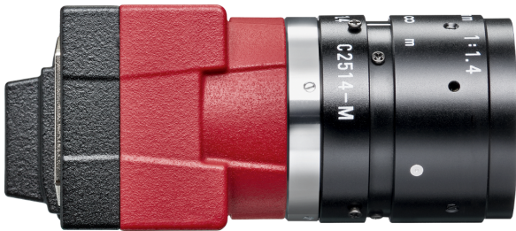
Model without hardware options